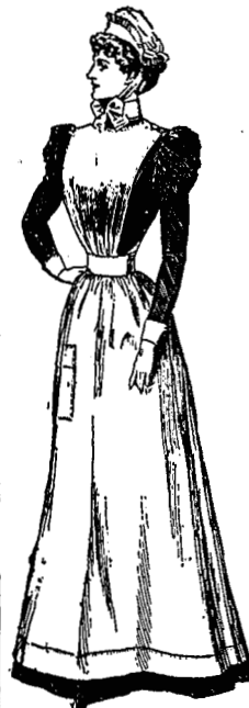
The "Rena" Apron. Made of linen finished Cloth lock-stitch throughout, 2/6 each. In two sizes, 36 in. & 39 in. from waist to hem.